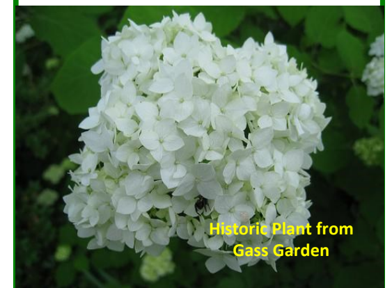
Historic Plant from Gass Garden