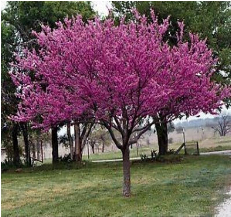
Eastern Redbud Tree