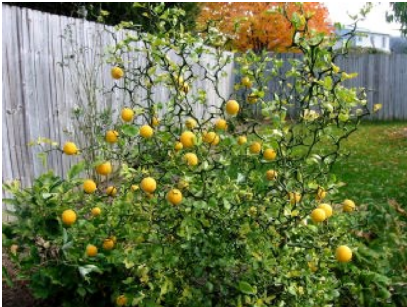
Hardy Orange Tree