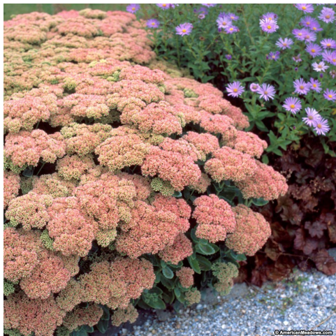
Sedum ' Autumn Joy'