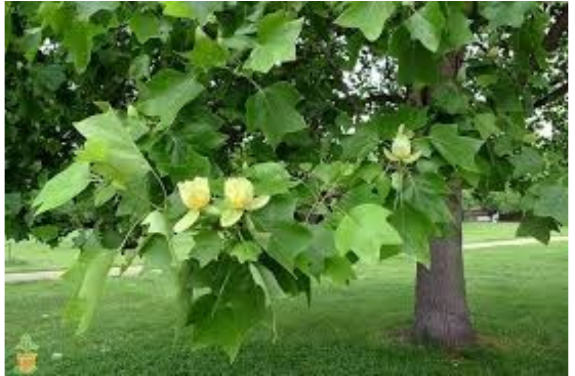
Poplar Tulip Tree