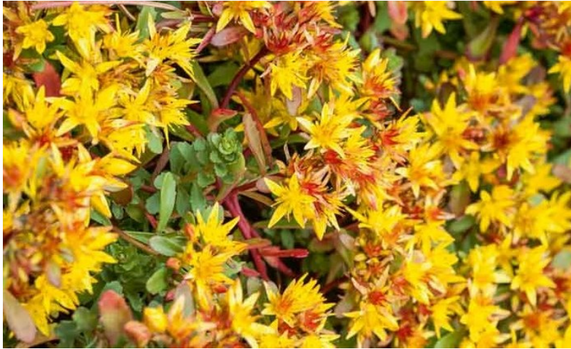
Sedum Russian Orange