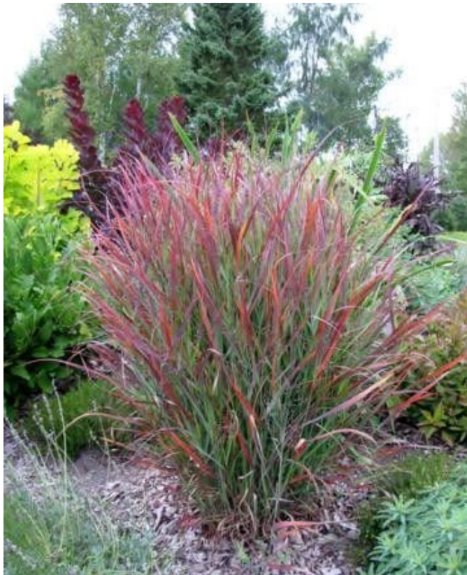
Switchgrass 'Red Cheyenne'