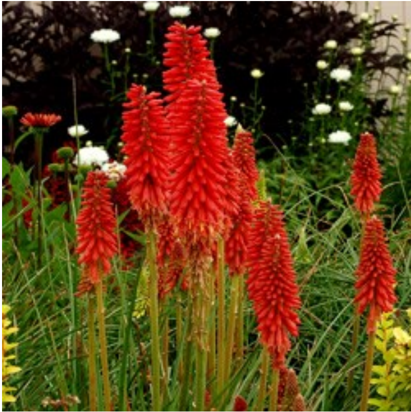
Red hot Poker