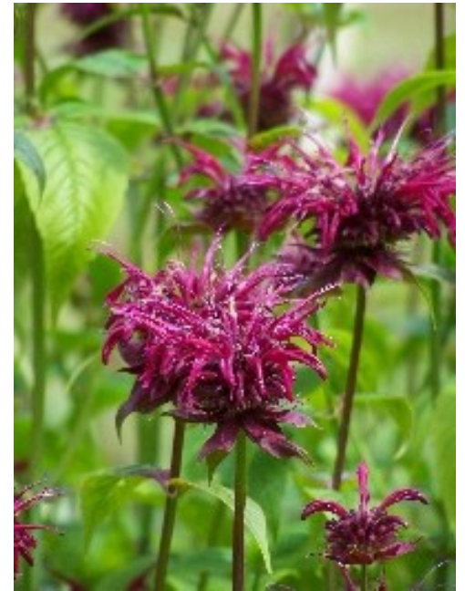
Bee Balm, Mahogany