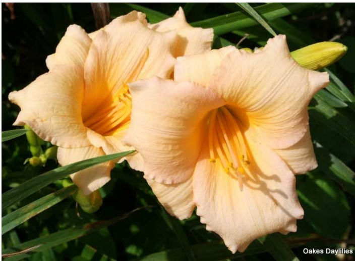
Daylily 'Minnie Pear'