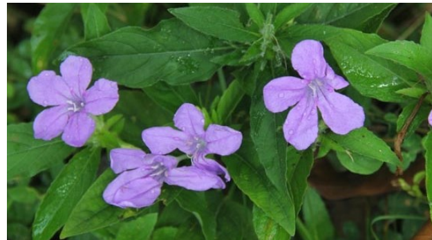
Petunia, Carolina Wild