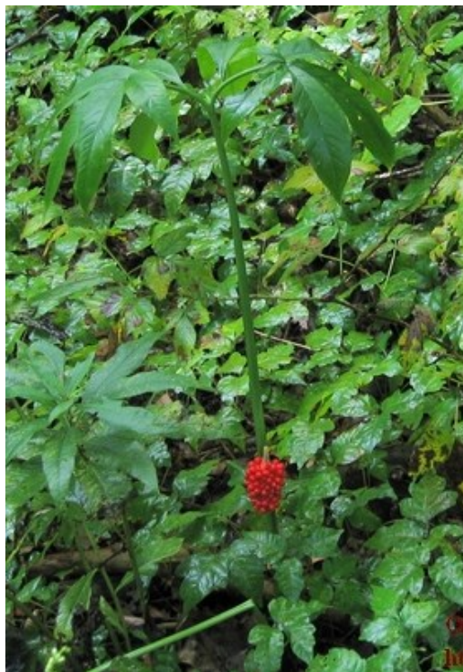
Dragonroot 'Green Dragon'