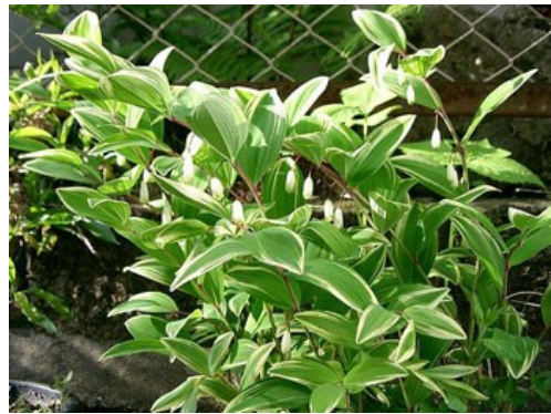
Solomon's Seal, Variegated