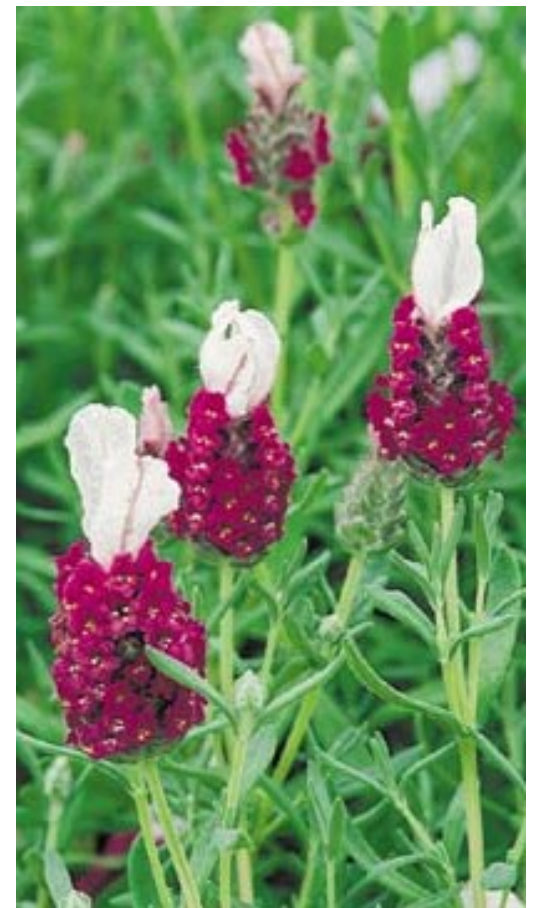
Lavender 'Kew Red'